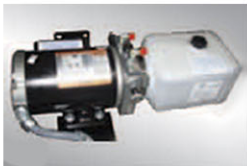
HYDRAULIC SYSTEM WITH HEAVY DUTY 1 HP MOTOR.