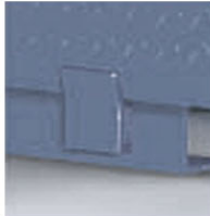
Dual purpose lip keepers for both cross traffic support and night locks.