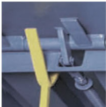
V-grooved maintenance stand supports both deck and lip for safe under deck inspections