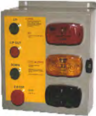
Panel illustrated with optional Traffic light system

Available in 30,000, 35,000, 40,000 lb, and 45,000lb (13,636, 15,909, 18,144 kg, and 20,455kg) Rated Capacities