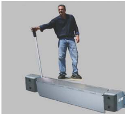
Insert comfort grip handle