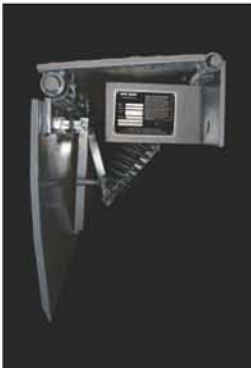
Stored traffic position

The MED Series edge-of-dock leveler from DOCK-RAMP is ideally suited for applications where installation of pit levelers is not feasible or where standard fleet bed heights are serviced at the loading dock. The MED Series is easily installed to the dock face providing an efficient self storing docking unit, replacing cumbersome dock plates.